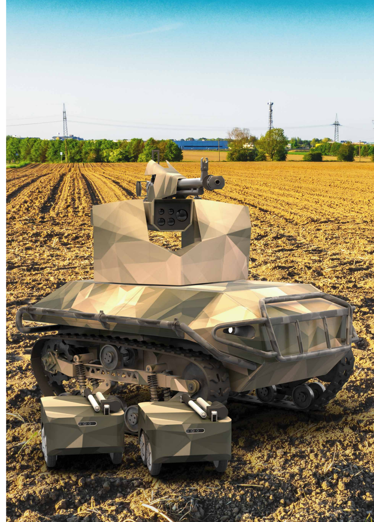
TRACKED UNMANNED ROBOTIC PLATFORM – ROBOT CARRIER SCORPIO 3